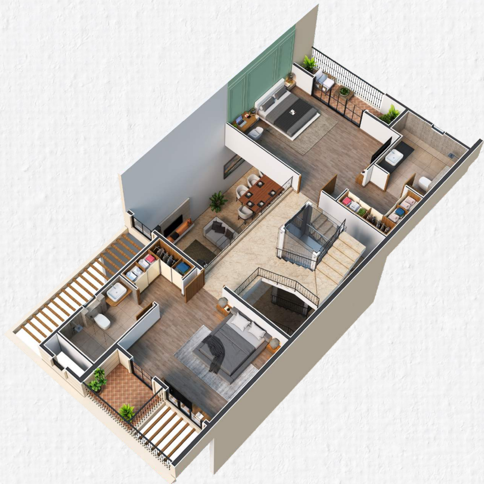
5 BED VILLAS ISOMETRIC VIEW