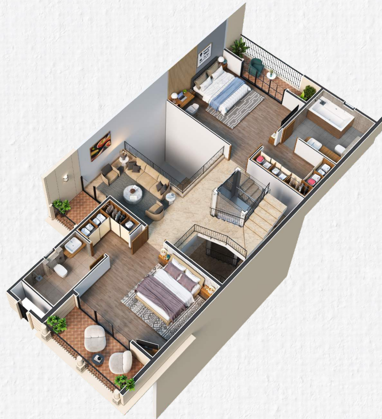
5 BED VILLAS ISOMETRIC VIEW