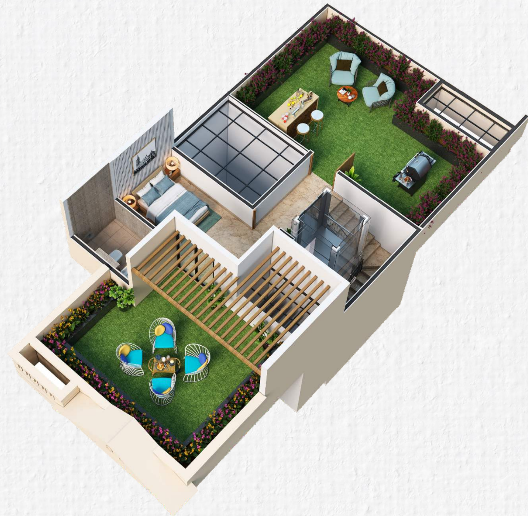
5 BED VILLAS ISOMETRIC VIEW