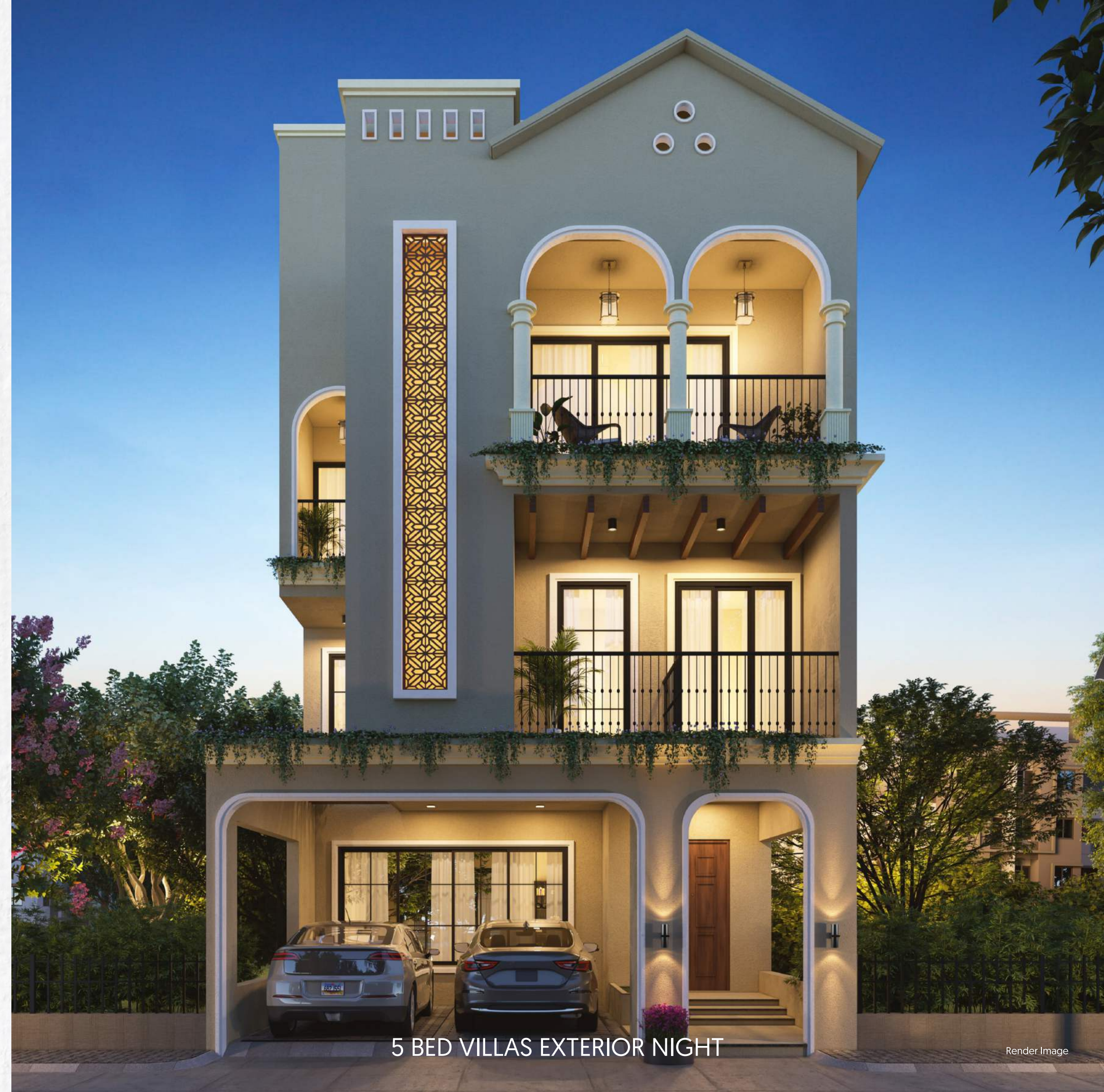
5 BED VILLAS EXTERIOR NIGHT

Walk-in wardrobe and balconies with each room