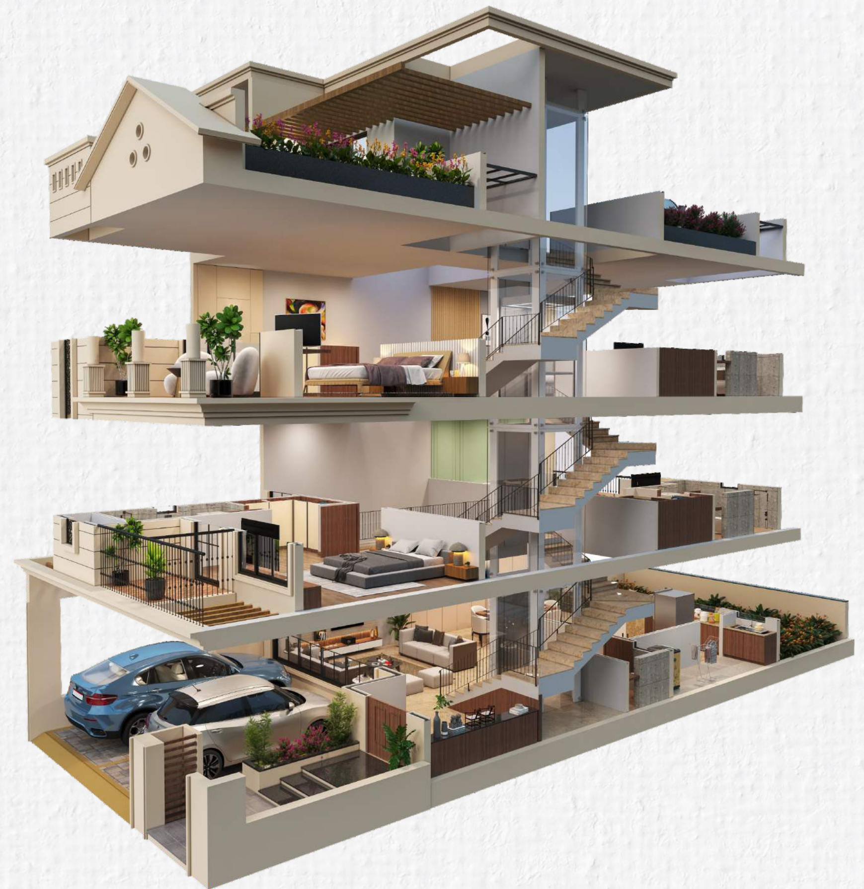
5 BED VILLAS ISOMETRIC VIEW