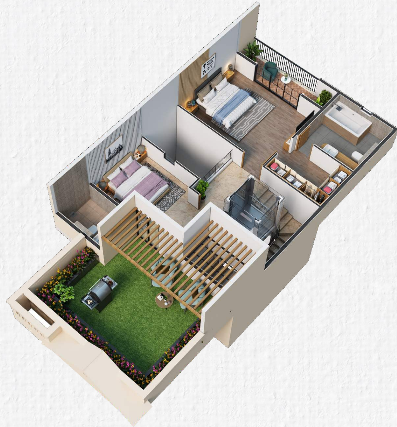
4 BED VILLAS ISOMETRIC VIEW