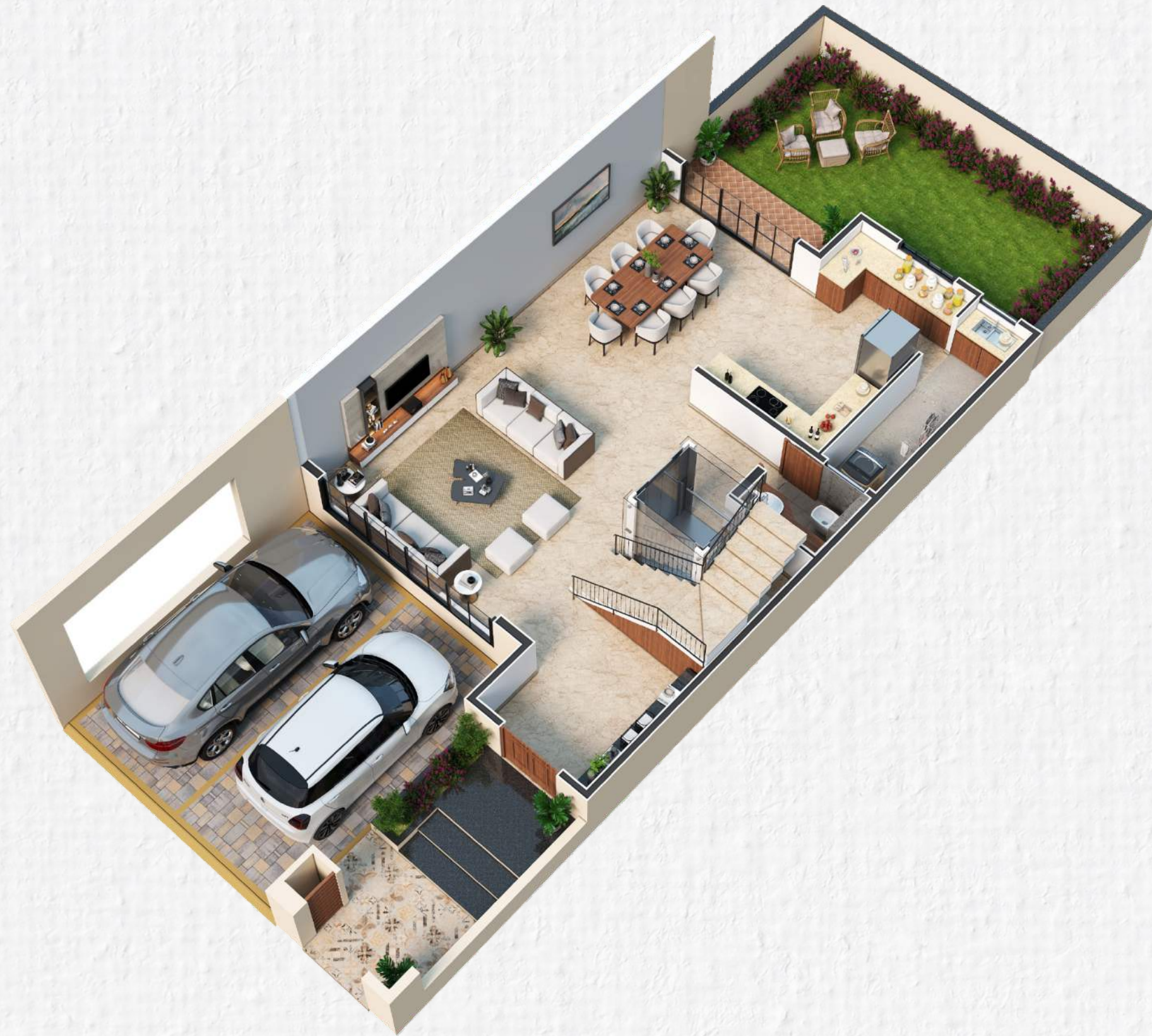
4 BED VILLAS ISOMETRIC VIEW