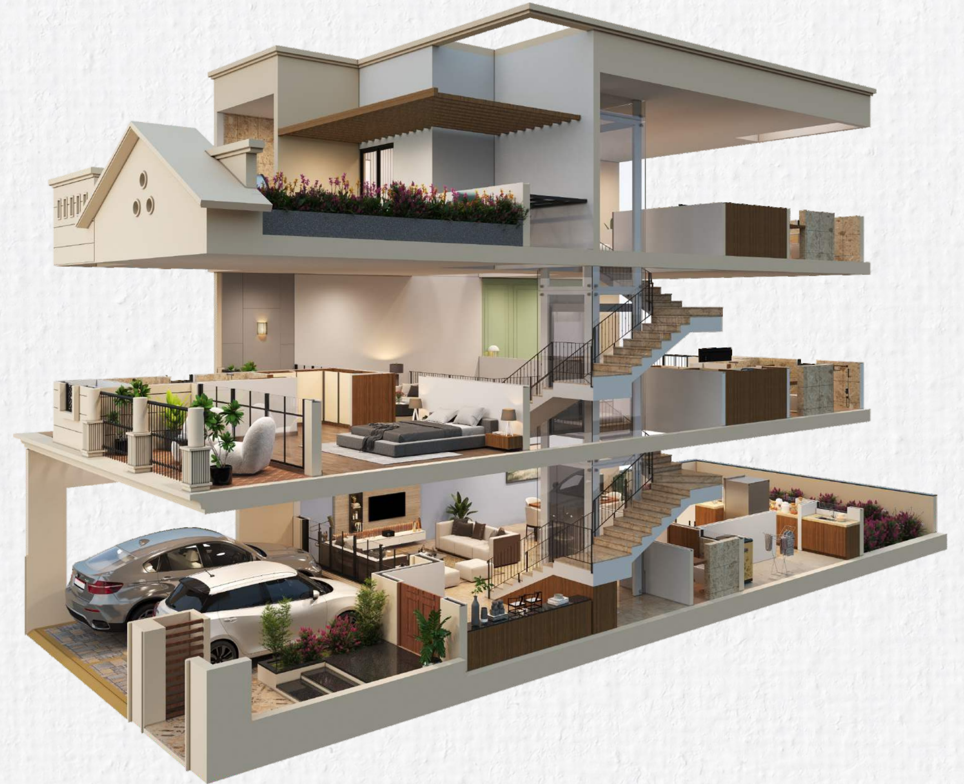
4 BED VILLAS ISOMETRIC VIEW