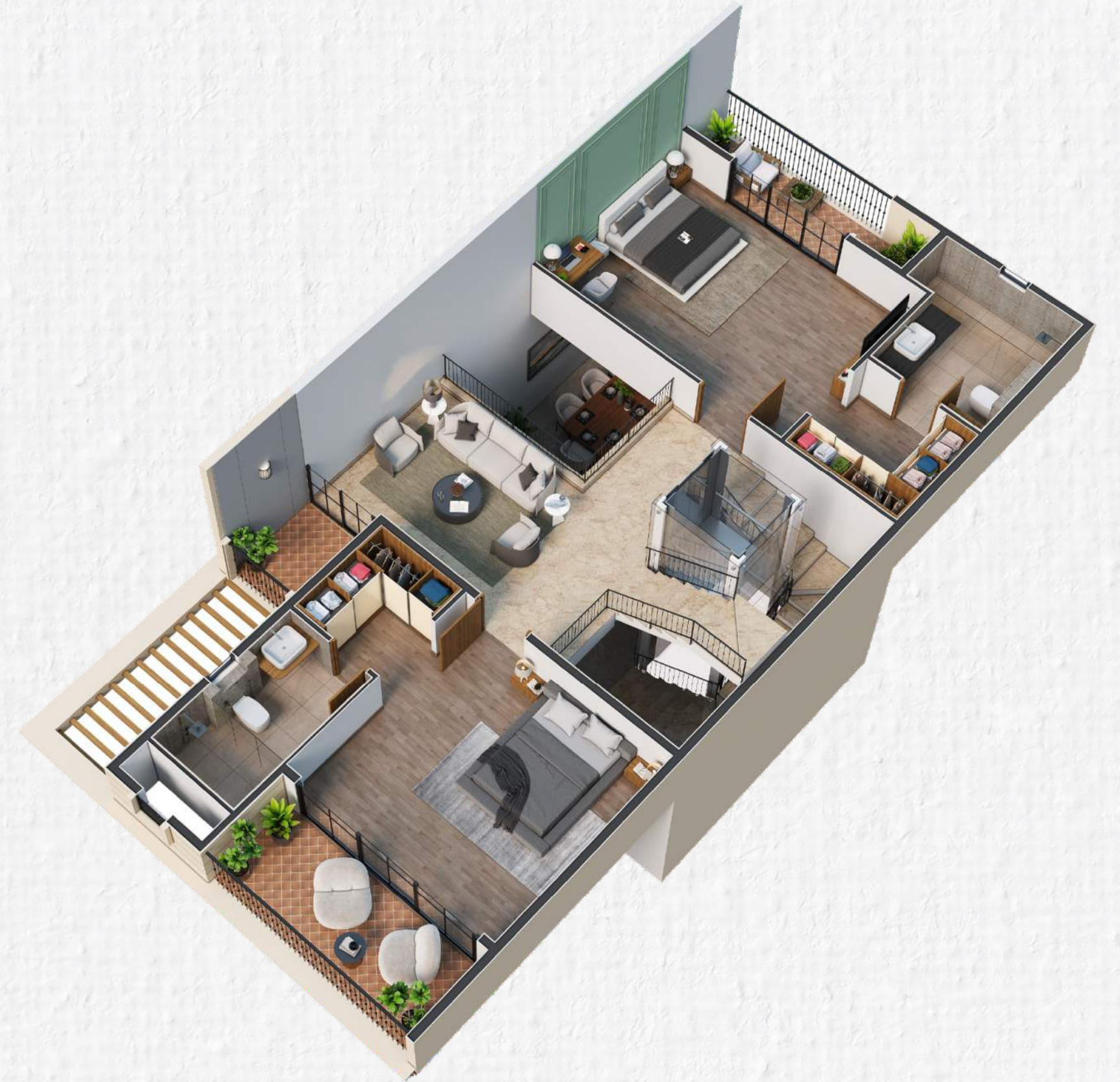
4 BED VILLAS ISOMETRIC VIEW